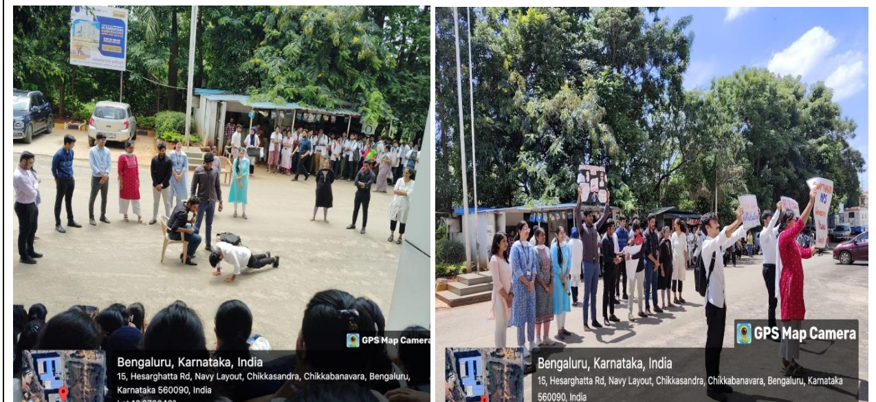
MBBS students telecasted Student's Short Movie and also performed Student's Skit.