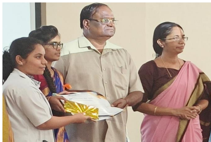
Students displaying their hand-made posters in the auditorium on Anti-Ragging theme.

The winning poster was judged and received a prize the following day. SNPSU medical student's active involvement demonstrates a strong sense of responsibility and empathy towards the wellbeing of their peers.